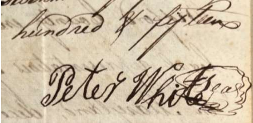
Figure 3: Peter White's signature on the power of attorney document.