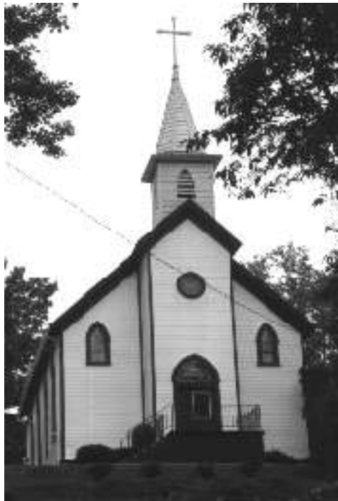
St. Michaels Catholic Church in West Salisbury in 1994.